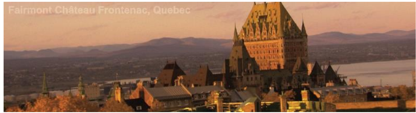
2018 - INDEPENDENT VACATION