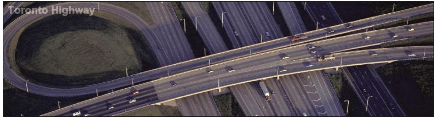
2018 – SELF DRIVE VACATION