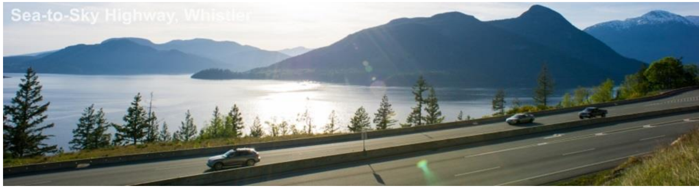
2017 - INDEPENDENT VACATION