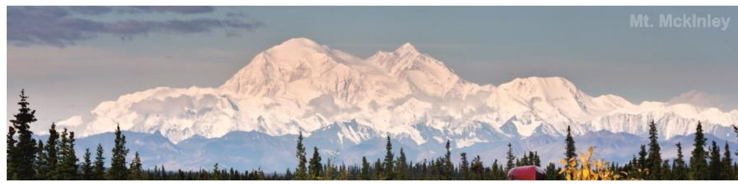
2017 - ΔΜΔΖΙΝG ΔΙΔSΚΔ