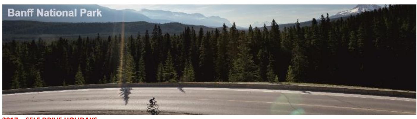
2017 - SELF DRIVE HOLIDAYS