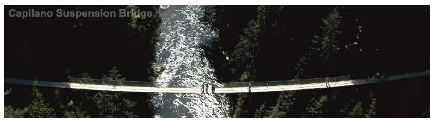
2017 - INDEPENDENT VACATION