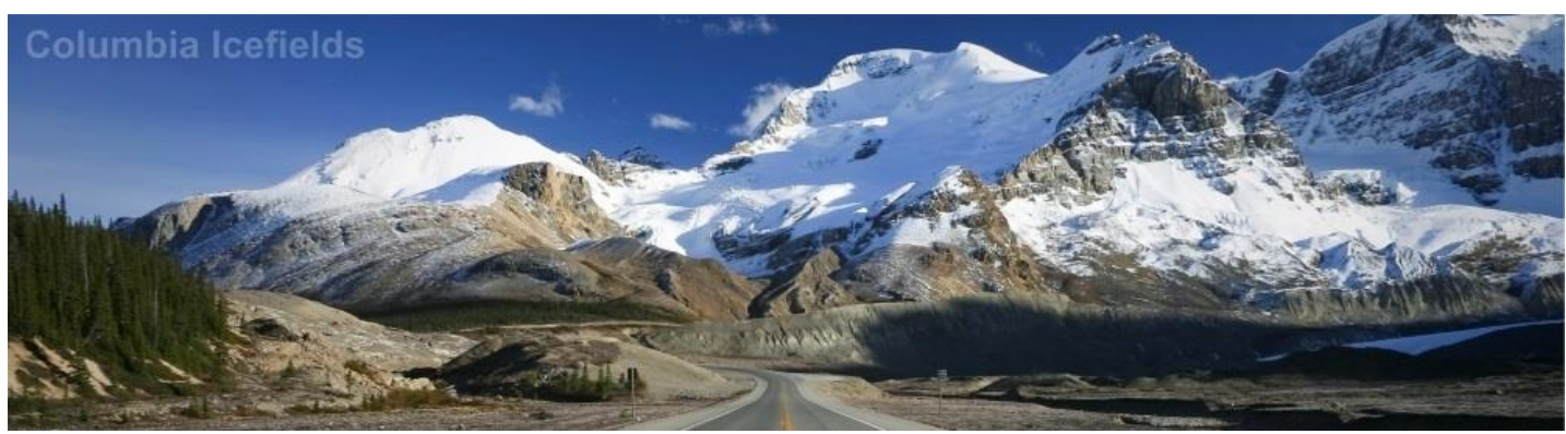
2017 - PRIVATE JOURNEY'S